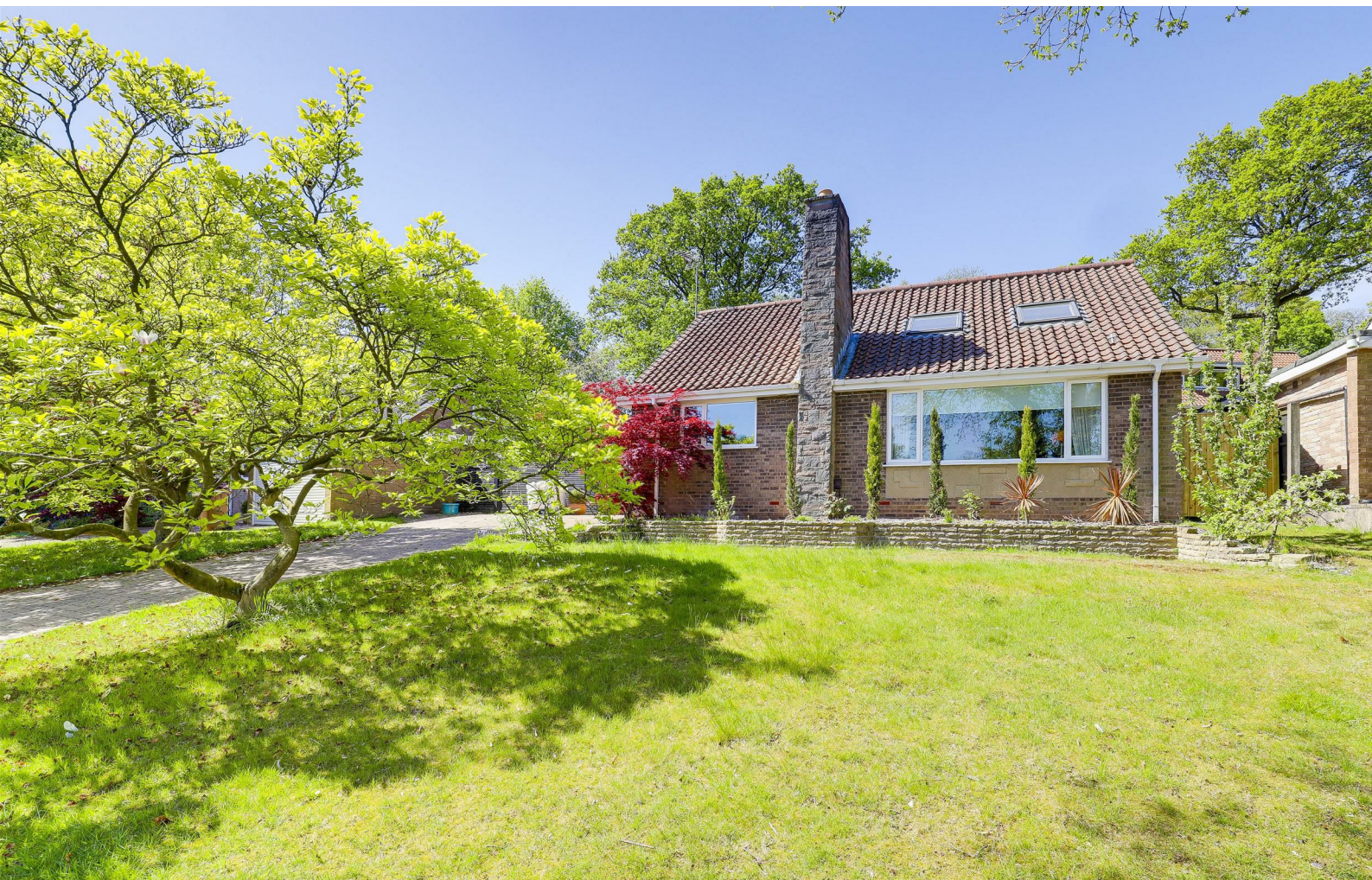
Mavis Avenue, Ravenshead, Nottinghamshire NG15 9EB